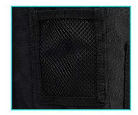
Side mesh bag