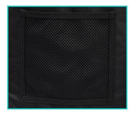
Front mesh pocket