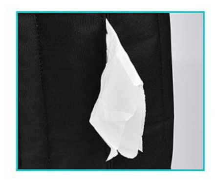
Front draw paper bag