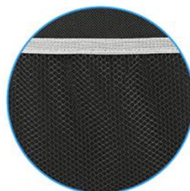
Three outer mesh pockets