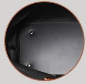
High quality PE rubber sheet