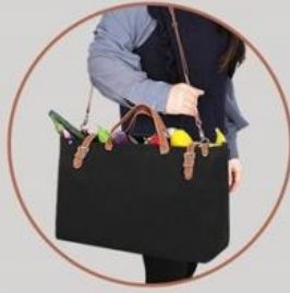
Comfortable shoulder strap

Made of high-quality soft PU material, very comfortable. The bottom is made of high-quality PE rubber sheet, which can bear a weight of 33 lbs (15 kg).