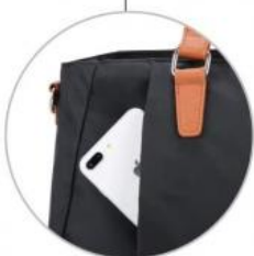
External zipper pocket