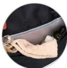
Waterproof wet pouch