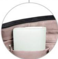
Inner slip pockets