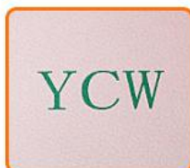
SILK SCREEN PRINTING