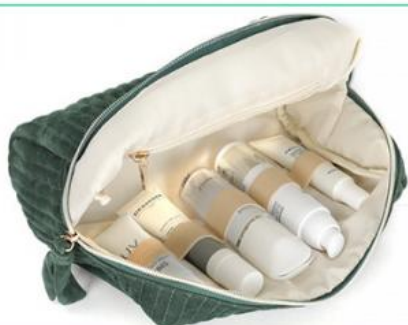
Elastic straps to hold bottles up right