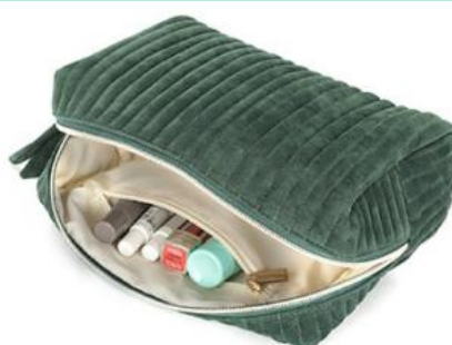
Inner zipper pocket