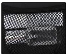
Transparent Mesh Bag