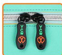
RUBBER ZIPPER PULLER