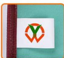
WASHING CARE LABEL