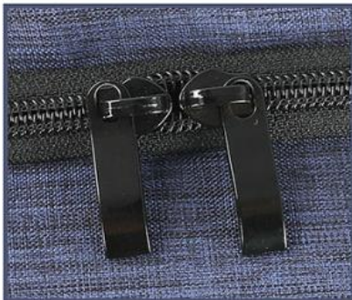
Metal double zipper