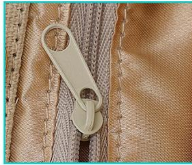
Internal zipper pocket