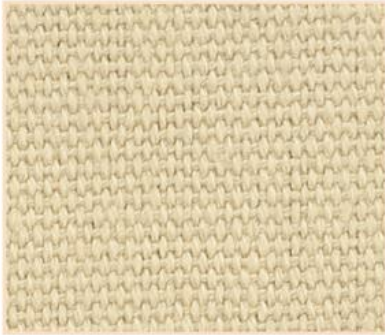
High quality fabric