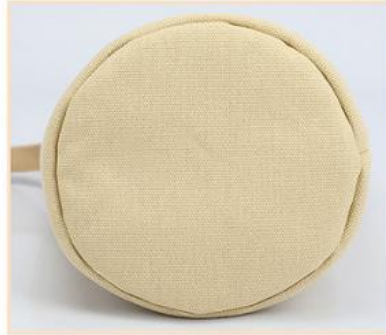
Round reinforcement at the bottom