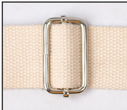
Adjustable Shoulder Strap