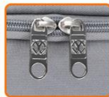
METAL DEBOSSED ZIPPER PULLER