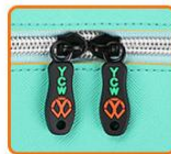
RUBBER ZIPPER PULLER