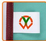
WASHING CARE LABEL