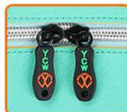
RUBBER ZIPPER PULLER