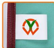
WASHING CARE LABEL