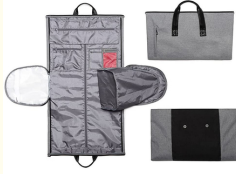
Various folding ways of bags make travel more convenient and quick