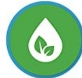
MADE FROM RECYCLED MATERIALS PROTECT OUR ENVIROMENT