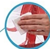
EASY TO CLEAN WITH WIPES