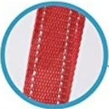
STURDY WEBBING HANDLES