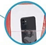
FRONT POCKET FOR ACCESSORIES