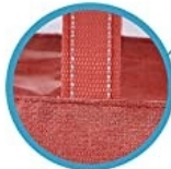
HEAVY DUTY STRUCTURE WITH HANDLES SEWN TO THE BOTTOM