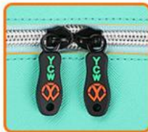
RUBBER ZIPPER PULLER