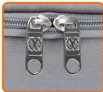
METAL DEBOSSED ZIPPER PULLER