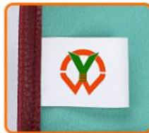
WASHING CARE LABEL