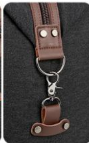
2.Shoulder strap sturdy hook connection