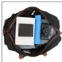
Internal capacity display