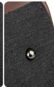
5.Bottom anti-wear rivet design