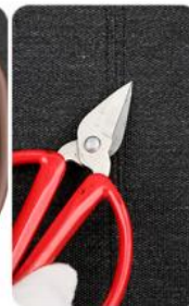
4.Wear-resistant canvas fabric