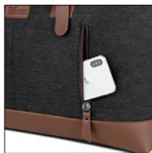
Side zipper pocket design