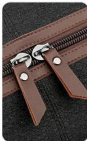
1.Rugged two-way slider

Details determine quality, hardware accessories products are trustworthy