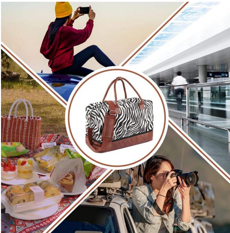
1) Duffle Bag Color Options :