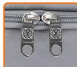
METAL DEBOSSED ZIPPER PULLER