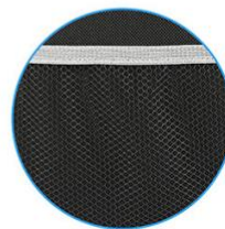
Three outer mesh pockets