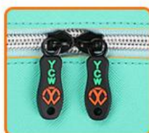
RUBBER ZIPPER PULLER