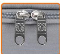
METAL DEBOSSED ZIPPER PULLER