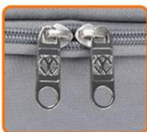
METAL DEBOSSED ZIPPER PULLER