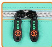
RUBBER ZIPPER PULLER