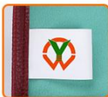
WASHING CARE LABEL