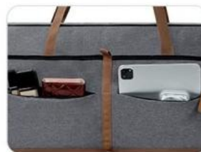
2 Front Pockets