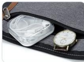
1 Inner Zipper Pocket