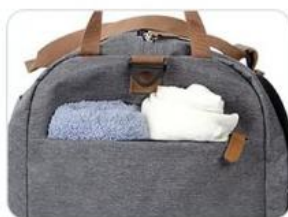
Right Waterproof Pocket for Underwear or More