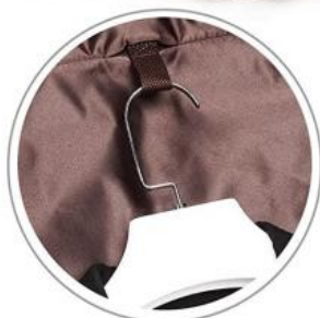
Hanging Suit Design