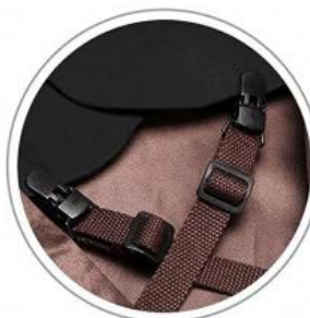
2 Fixing Buckles