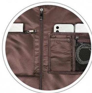
Various Internal Pockets