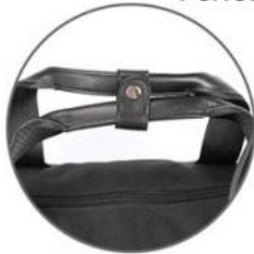
Comfortable PU handle

Perfect for business trips and weekend getaway