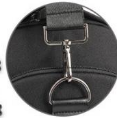
Solid metal hook