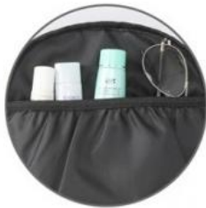
Built in pocket