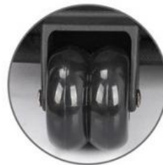
Wear resistant mute wheel