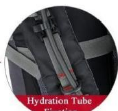
Hydration Tube Fixation