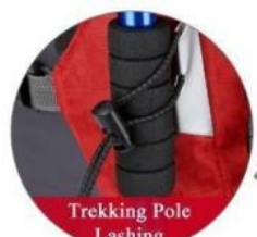
Trekking Pole Lashing