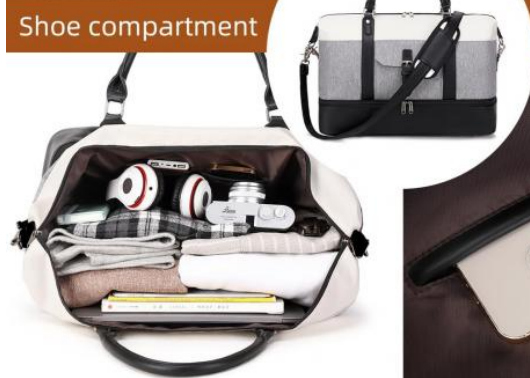
Large capacity main bag