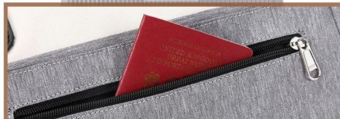
Anti-theft zipper pocket on back