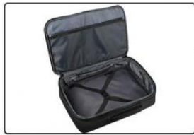
Back Main Luggage Pocket