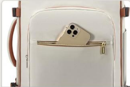
Front Zipped Pocket

Multi-compartments for great organization