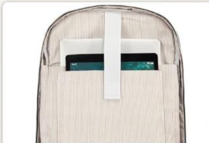
Back Laptop Compartment