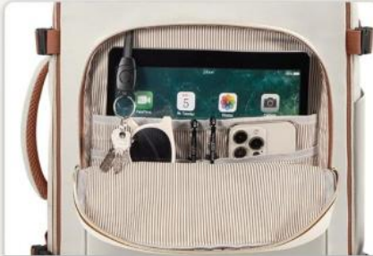
Front Big Compartment