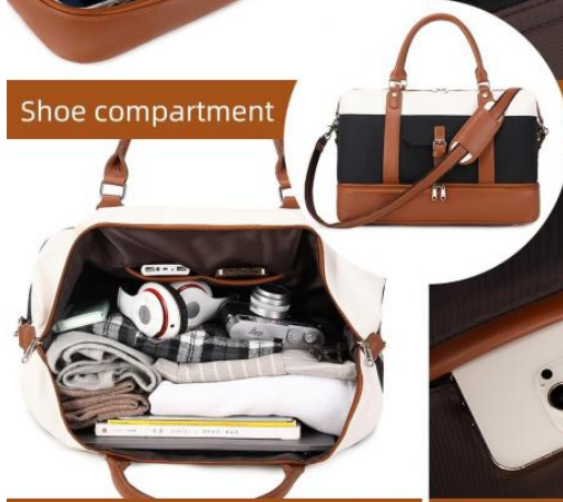
Large capacity main bag