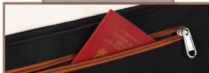
Anti-theft zipper pocket on back