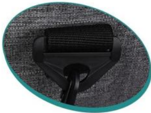
Shoulder belt buckle