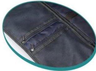
Cover storage bag