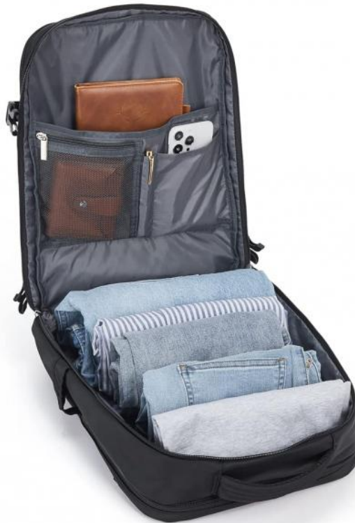
Large Main Compartment