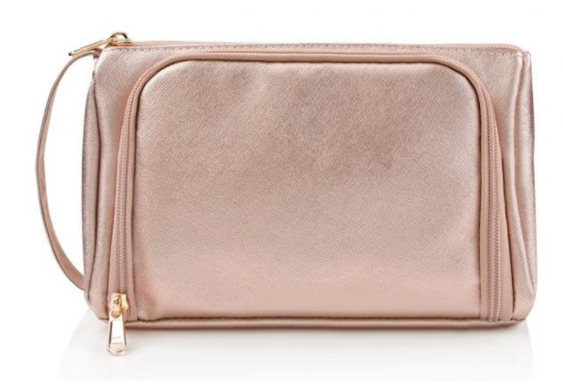
SBS Metal Zippers