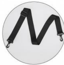
Reinforced Shoulder Straps