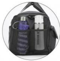
Side pocket design