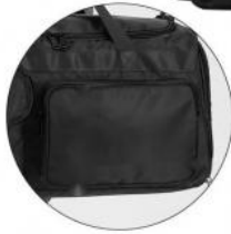
Front zip pocket