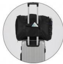
Luggage Trolley strap