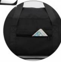
Back zip pocket