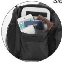
Front Velcro pocket