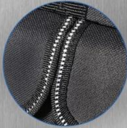
Unique Integrated Reflective Strips