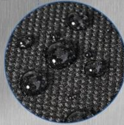
Water-Resistant 600D Oxford Fabric