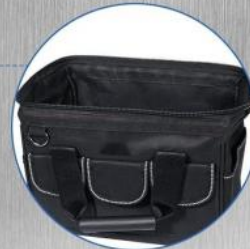
Full Access Open Top