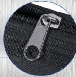
Heavy Duty Zippers