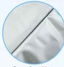
Seamless Hot Pressing