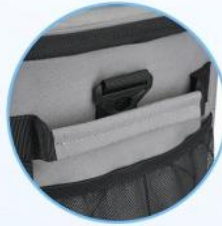
Reinforced Side Carrying Handles