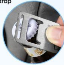
Stainless Steel Bottle Opener