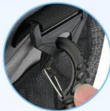
Detachable Shoulder Strap