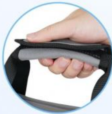
Reinforced Top Carrying Handles