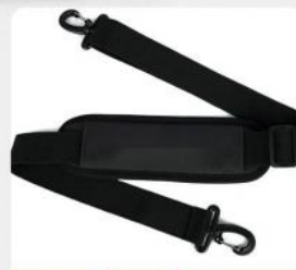
Adjustable Shoulder Strap