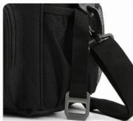
Integrated Bottle Opener