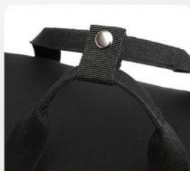
Comfortable Top Carrying Handle