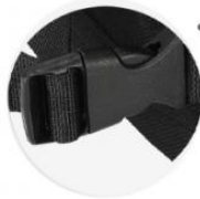
• Plastic buckle