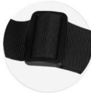
• Adjustable shoulder straps