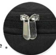
Smooth double zipper